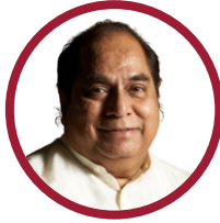
Padmashree Dr. D Y Patil

Founder - DY Patil Group Former Governor - Tripura, West Bengal, Bihar